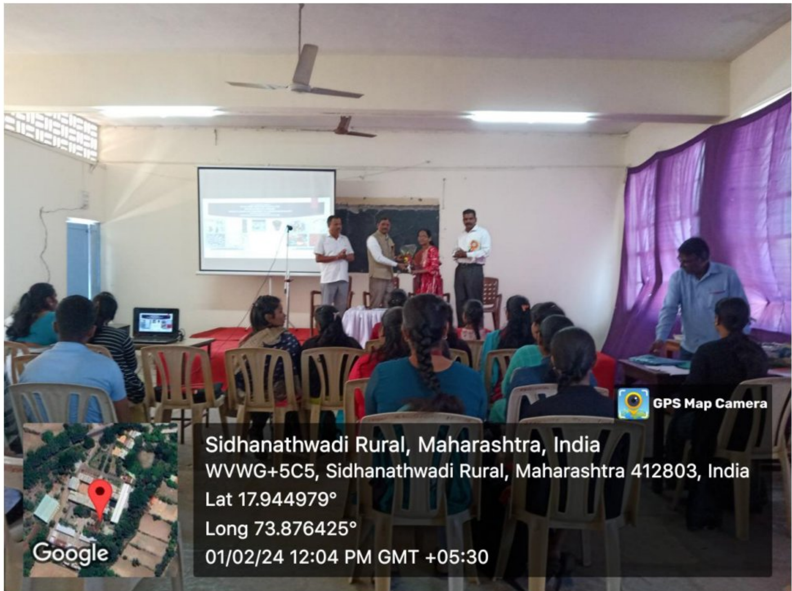
Felicitation of Guest : Mrs Varsha Gaikwad