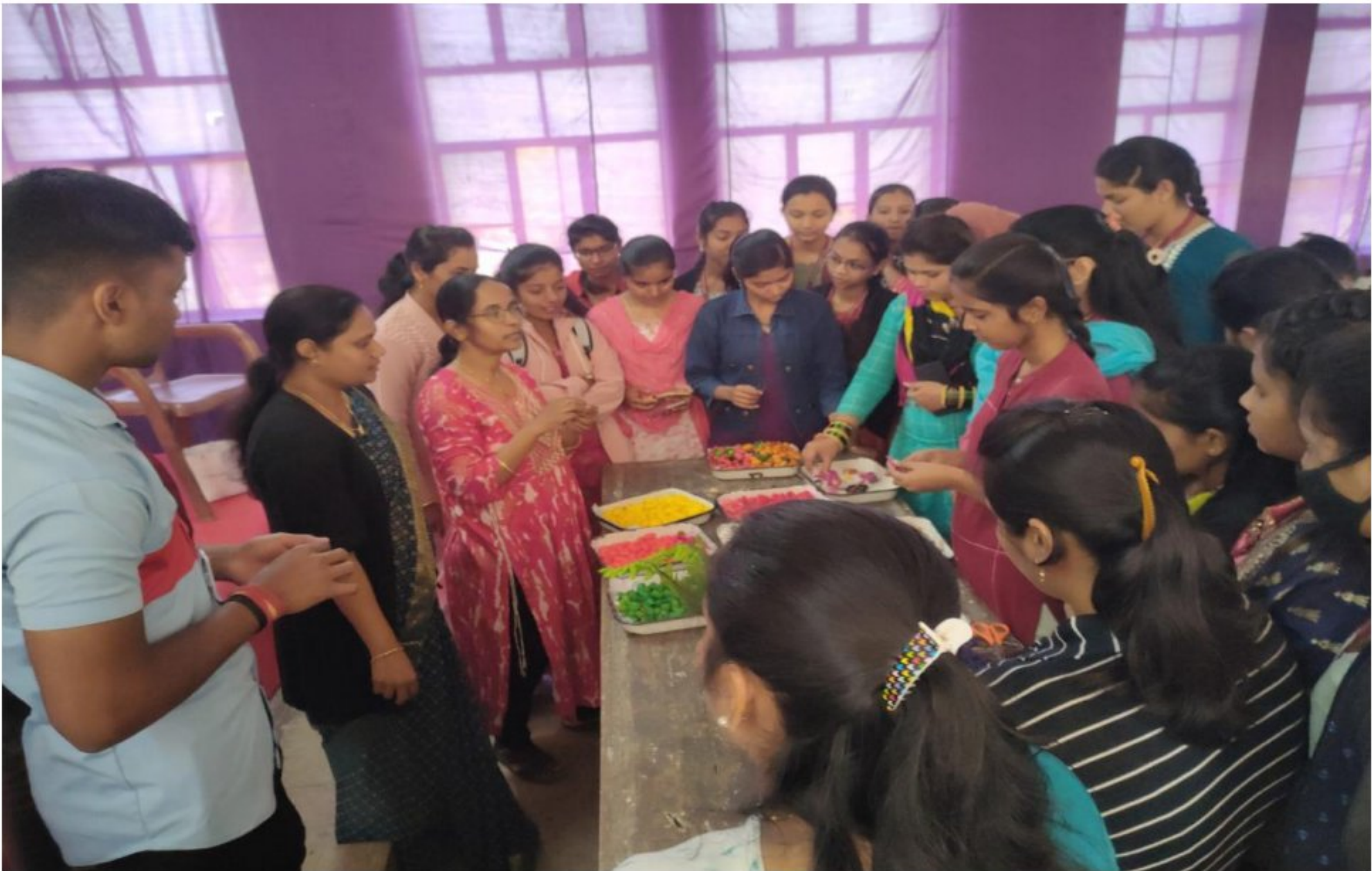
Workshop attaining students