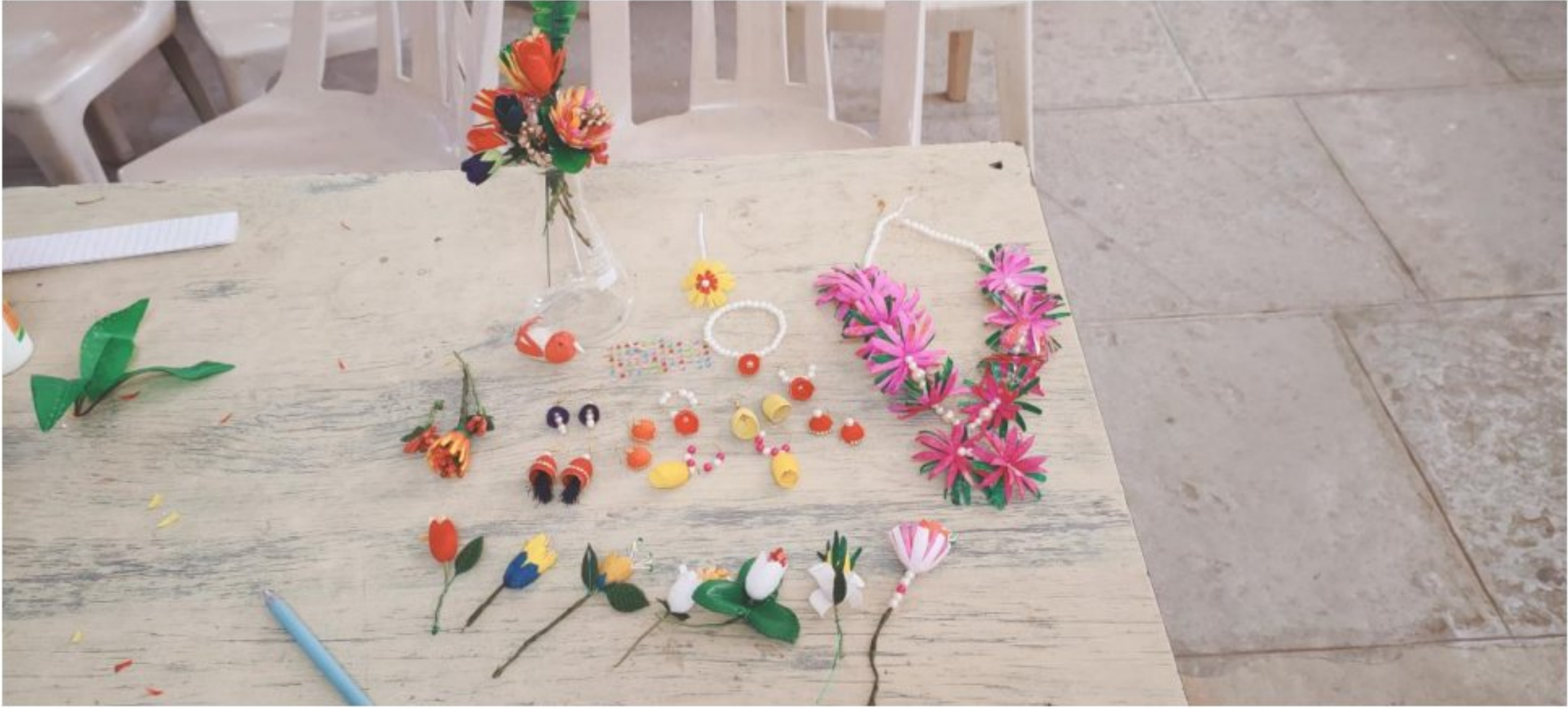
Crafts making using cocoon